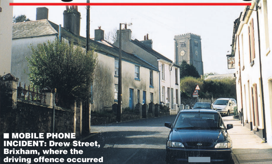
■ MOBILE PHONE INCIDENT: Drew Street, Brixham, where the driving offence occurred