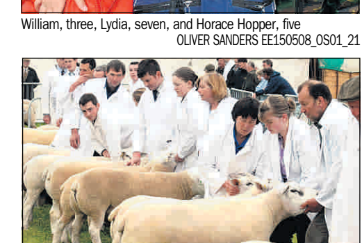
Competitors in one of the sheep classes