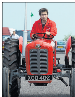
A vintage tractor