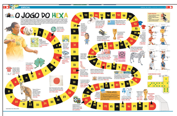
Board games just for amusement.

Personality tests to help the reader to define to which team they were more likely to support when Brazil wasn't playing.