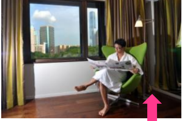
Low Sze Ping (刘思斌) <a href="http://blog.omy.sg/szeping">http://blog.omy.sg/szeping</a> Best Photography Blog Winner 2009, Best Photography Blog Finalist 2010

As a mom of two little ones, I shoot, I write and I share how life can be beautiful with two kids in tow! I share the ups and downs of motherhood, activity ideas for kids, parenting tips as well as regular food for thought with a hope to inspire others.